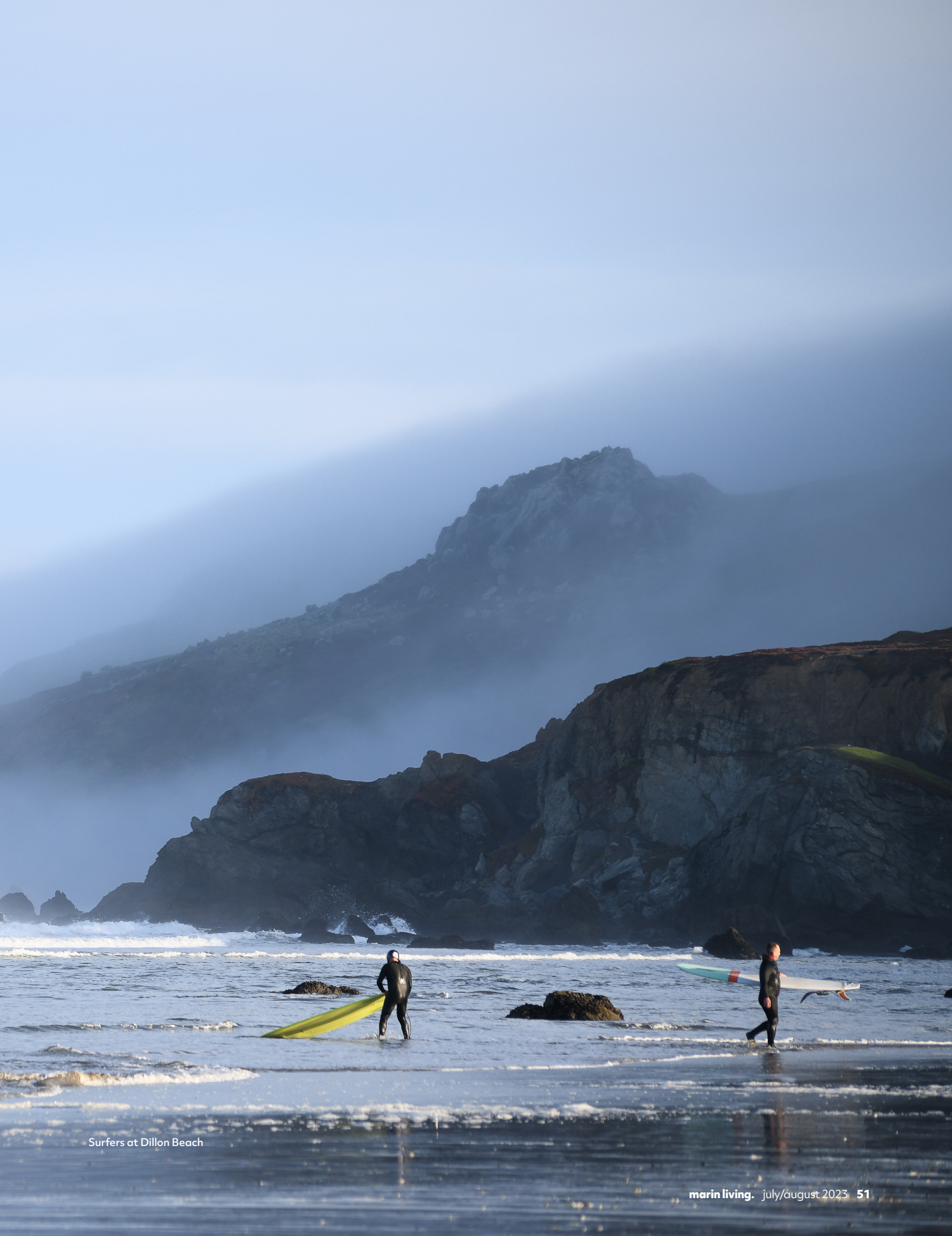
Surfers at Dillon Beach