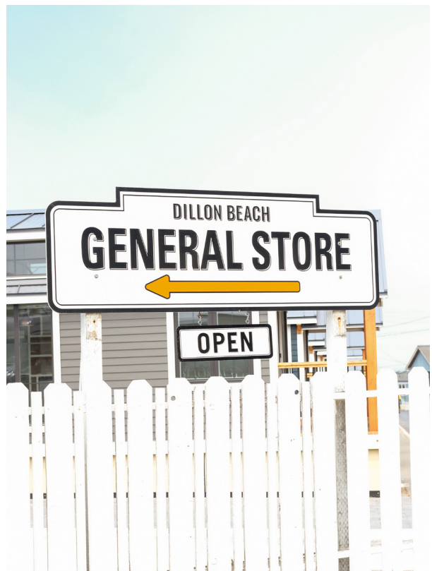
A visit to the on-site restaurant and general store is a must.