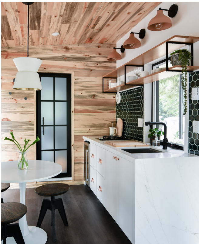
The new accommodations